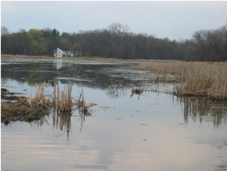
Channel Looking East